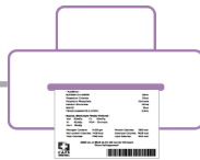
Pharmacist Prints Label