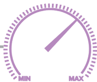
Min / Max