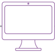
Order Approved by CAPS Pharmacist