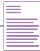
Mix Check Report